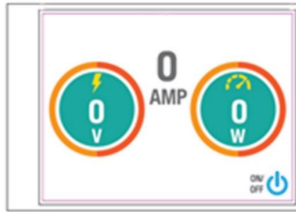
When bluetooth signal off

DC input will appear on top right side of the screen if there is a battery connected to the input of the inverter. See below: