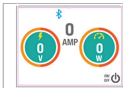
When switch off main unit

When the ON/OFF button on the bottom right corner of the screen is pressed, the main unit will shut off (to grey colour) , and the LCD screen will indicate that there is no input and output. See below: